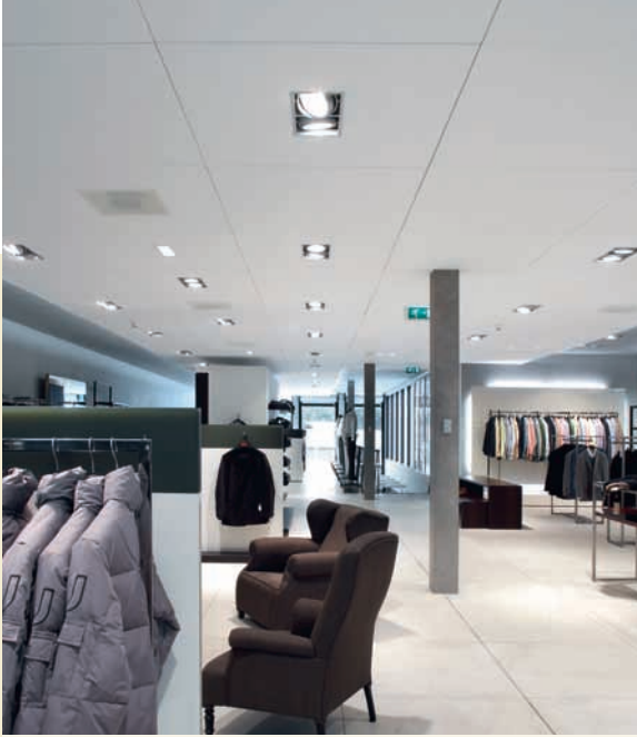
Left : Fashion Centre Voorwinden, 's-Gravendeel, The Netherlands Architect: Architekturburo Roos en Ros Product : Techstyle™

Techstyle™ brings design flexibility to the forefront with panels that come standard in sizes ranging from 600 x 600 mm to 1200 x 2400 mm. The modular system allows you to mix and match sizes to create distinctive looks for a room.